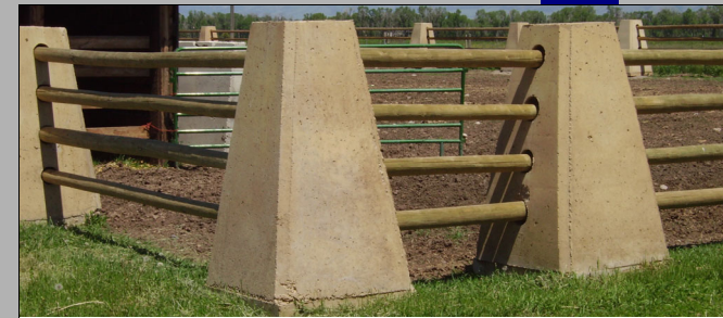
Fence Posts (6,000 lbs) 5' x 2' x 2' base 1' x 1' top $230 Small 5' x 3' x 3' base 1' x 1' top $270 Large