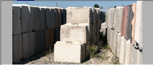
1/2 Yard Retaining Wall Blocks 2' x 2' x 3' (2,000 lbs) $110 Plain Sided