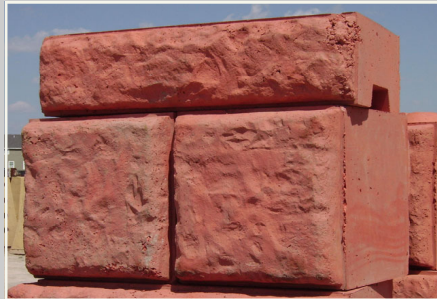
Half Knob Block 2' x 2.5' (2350 lbs) $170 Stone-Face $140 Plain