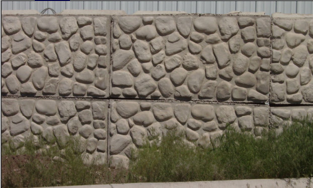
2-Yard Retaining Wall Blocks 3' x 3' x 6' (8000 lbs) $190 Plain Sided $240 Stone-Face