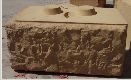
Large Knob Block 2' x 2' x 4' (4700 lbs) $195 Stone-Face $175 Plain