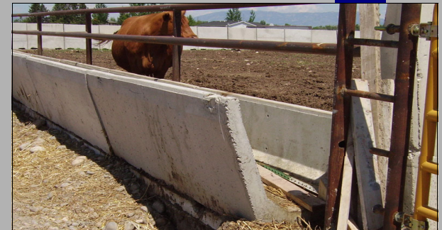
Feed Bunks 8' Long, 33" Tall Back, 16" Front Lip (2700 lbs) $210