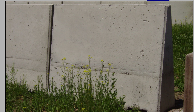
Bull Pen Fence Blocks 6' long, 5' tall, 2' base and 6" top (5000 lb) $245 9' long, 5' tall, 2' base and 6" top (7500 lb) $310